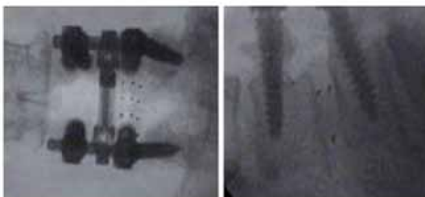
(L) AP view of five modules in situ using Interfuse device (R) Lateral view of same