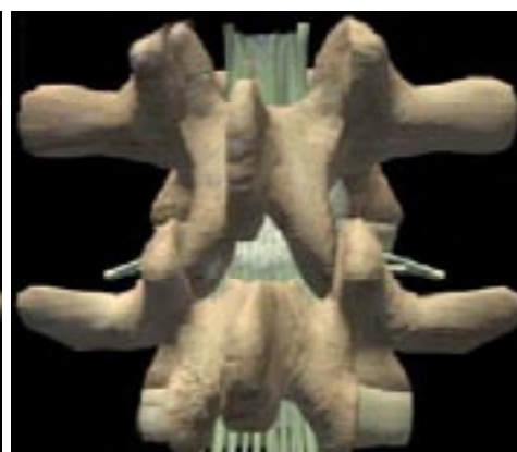
Figure 3: Magerl translaminar facet screw (1984). The entry point of the screw is at the junction of the spinous process and lamina of the contralateral side. The exit point is the base of the pedicle as in the Boucher technique.