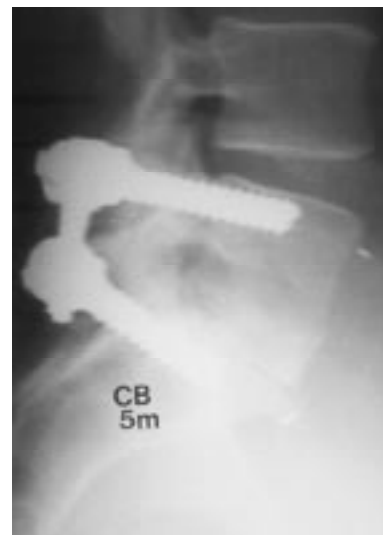
Figure 6: Lateral x-ray of circumferential fusion L5-S1 with femoral ring allograft anterior and pedicle screws and rods posterior.

Summary statistics (number, mean/frequency, standard deviation/percentage, and range) were provided for age, gender, spondylolisthesis, previous lumbosacral surgery, pre-operative VAS for pain, at the L5-S1 level, and number of levels fused. Summary statistics were listed for both the total patient population (80 patients) with adequate records and the patients with 2 year post-operative follow-up (67 patients). A frequency table was provided for the categorical variable of number of reoperations by type of device, either translaminar facet screws or pedicle screws. Fisher's exact test was used to test for an association between the number of reoperations and type of device. The odds ratio and 95% exact confidence interval were also calculated. The Mann-Whitney test was used to determine an association between VAS score and in-