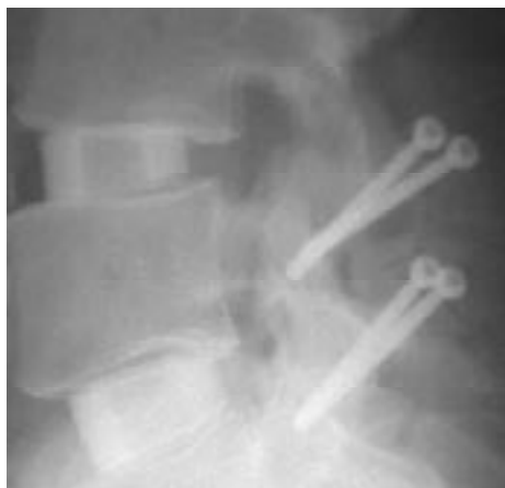
Figure 4: Lateral radiograph of two-level fusion with interbody graft and translaminar facet screws.

stiffness under cyclic loading (4 sec/cycle) after 5,000 cycles. Additionally, biomechanical comparisons have been made between pedicle screws and translaminar facet screws. Deguchi et al (9), found a statistically similar performance in the flexion-extension biomechanics of pedicle screws and translaminar facet screws. Ferrara et al showed similar results with comparable stability and mechanical fixation with less destruction than pedicle screws (11). Thus, the literature has shown that despite being less invasive and bulky, translaminar facet screws provide comparable stiffness, rigidity, and purchase in multiple biomechanical studies.