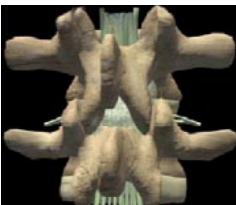
Figure 2: Boucher modification of King's facet screw (1959). The screw is aimed into the base of the pedicle thus increasing the length of the screw in the inferior vertebrae.